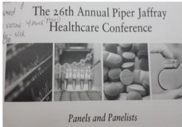
First time talking to so many "C's" in 2 days